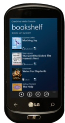
Windows® Phone 7